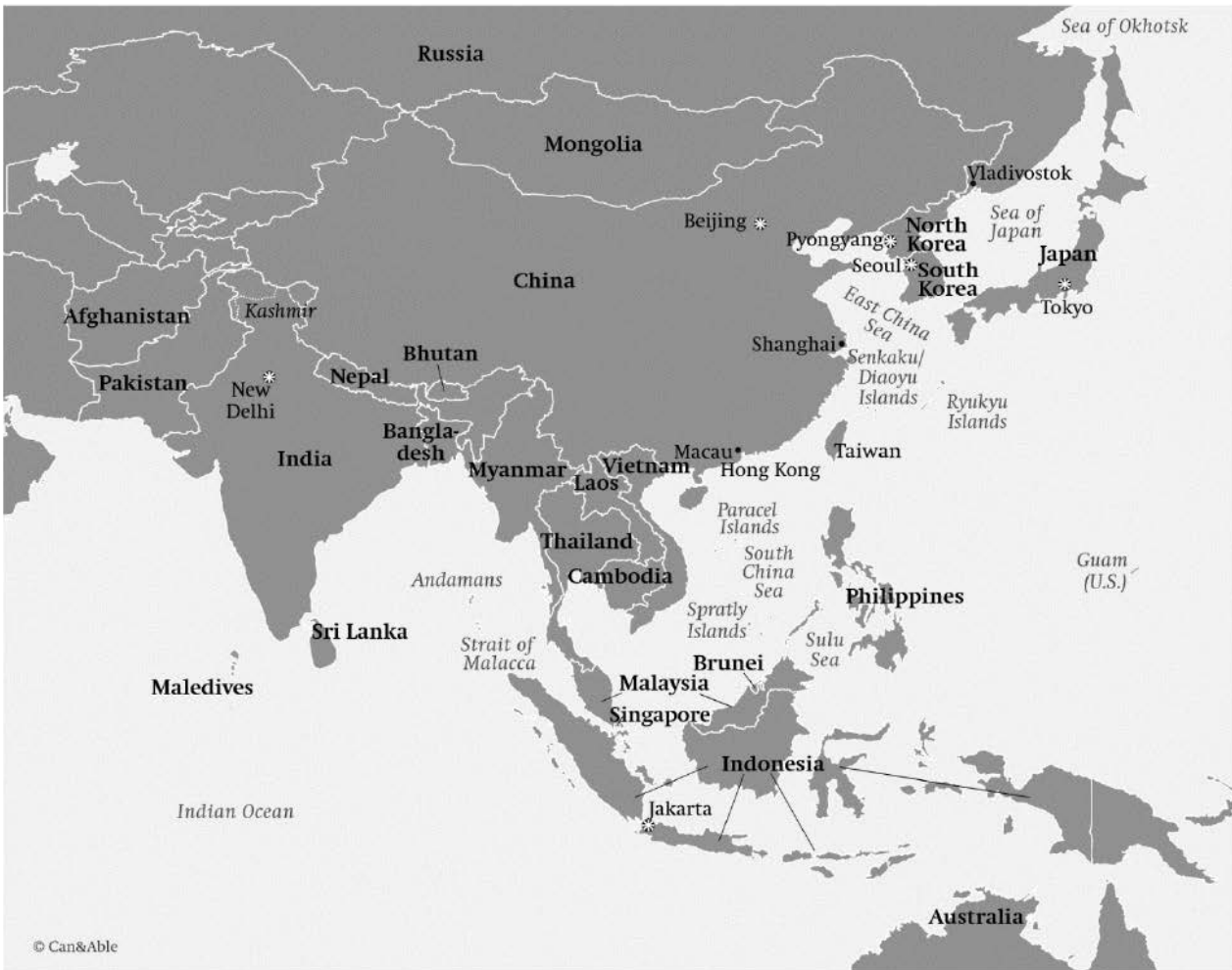
Map 1 Asia