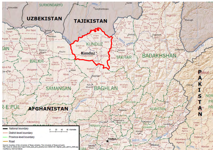
Kunduz, northern eastern

were made during the very first phase of the mission. They still have a great negative impact on the current situation. One major failure is, as General Stanley McChrystal stated, that 'even now the military lacked sufficient local knowledge to bring the conflict to an end.' 15 Furthermore he admitted that 'we didn't know enough and we still don't know enough. Most of us, me included, had a very superficial understanding of the situation and history, and we had a frighteningly simplistic view of recent history, the last 50 years.' 16 The following section includes a paragraph dealing with available sources and literature on the history of Kunduz and also briefly assesses the few booklets and other information material German soldiers or civilian personnel receive when preparing for a mission in Afghanistan's northeast.