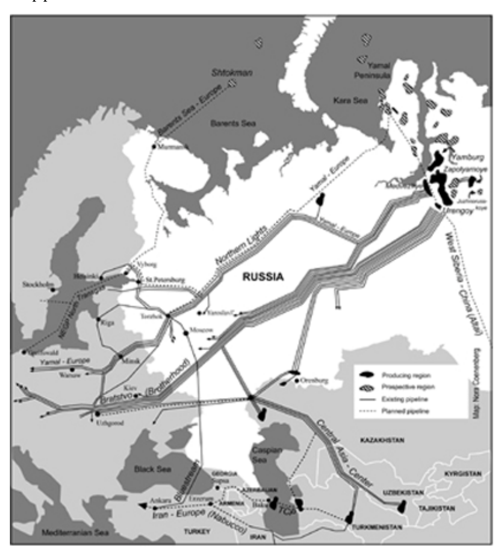
Map 1 Gas pipelines to the West

Moreover, a progressing geographical diversification of European gas imports is brought about by an increased use of LNG, although this does not apply to all European regions equally. LNG will gain importance above all in Southern Europe as well as in France and Britain, while increasing imports will make Germany and the countries of Eastern Europe even more dependent on gas coming in pipelines from Russia.