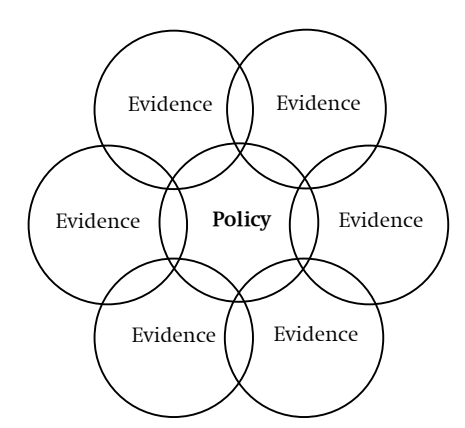
Figure 2 Evidence-based vs. evidence-informed policymaking

For some time now, responsibility for successfully addressing the climate problem has rested in the hands of governments.